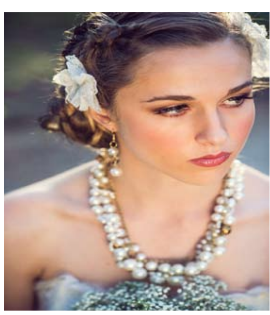
Global Wonders exclusive Bridal Line launching Spring 2015!